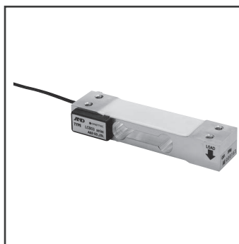
A&D LCB Series